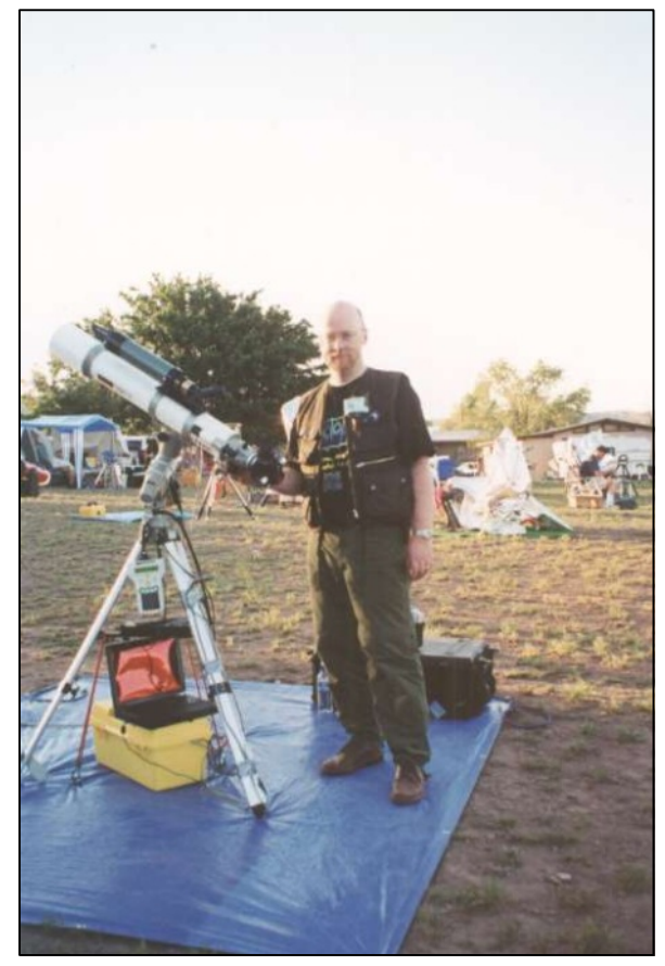
The author with his telescope, ready for a perfect night of observing.

I've carried an ETX90 and a Nexstar5 on as