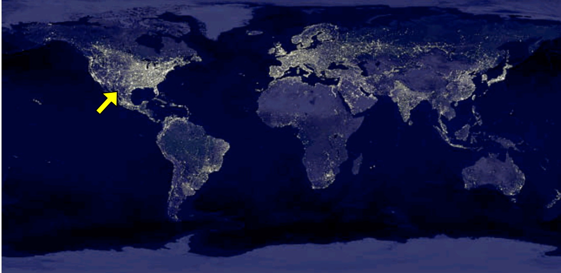
The Texas Star Party location is still a dark site, and is relatively far South giving good sky coverage.

From the UK the best way of getting there is to fly to El Paso via Dallas, and then drive about 180 miles to the ranch. The flight is the major expense of the trip, but early booking gets the maximum discounted fair. The car hire is also quite expensive, so I use it to see some of the magnificent countryside. The Rio Grande is a good day trip to make.