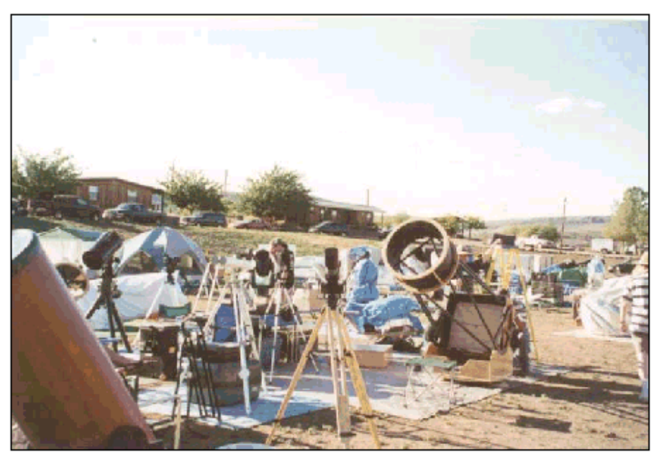
Just a few of the 500 telescopes set-up at the 2001 TSP. Equipment ranged from binoculars to 36" dobsonians.

Some of them are bigger than others, the Texas gathering being one of the largest. Others include Florida, Montana, and Washington State. When they get big they are a real masterpiece of organisation and planning. My first Star Party was a small gathering in Yucca Valley, up in the high desert east of Los Angeles. I managed to combine a business trip during the week, with the Star Party the following weekend. It was a low key event, but the combination of really dark skies and the opportunity to live and breath astronomy for a couple of days was inspiring. It some how relieved the frustration built up after a year of poor nights in the UK!