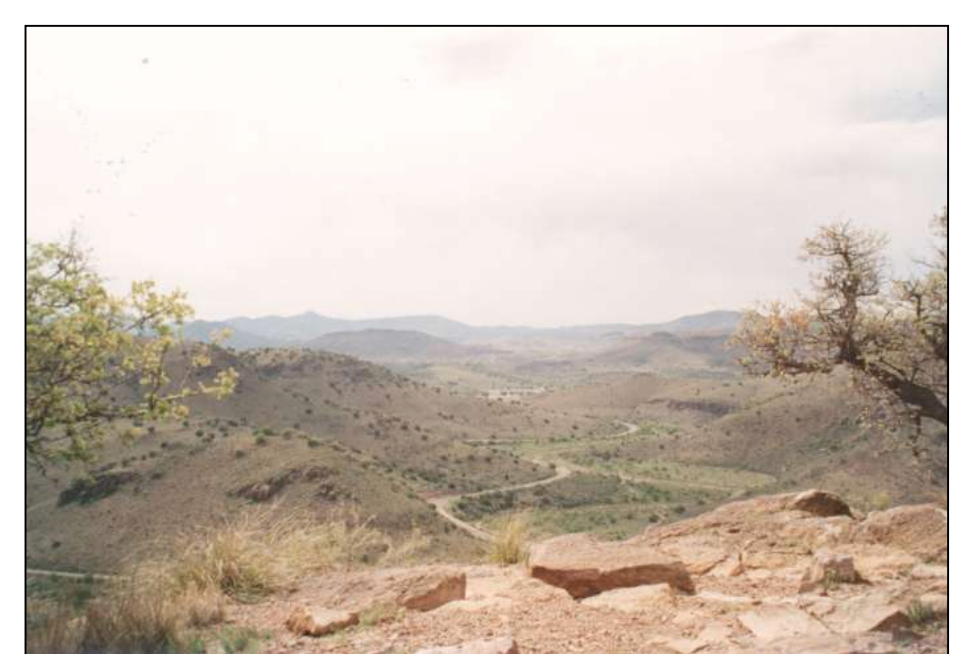
The Texas Star Party is held in a remote site high up in the Davis Mountains, West Texas. The site is in the centre of the photograph.

Those with small portable scopes are now all set. Those with medium scopes are probably thinking its impossible to take their favourite scope. Of course any one with a big scope will have to leave it at home, but having ones' own scope there is not essential at all. I estimate around 1 in 10 attendees have no telescope.